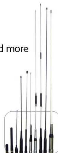
VHF/UHF mobile and handheld 2-way radio antennas