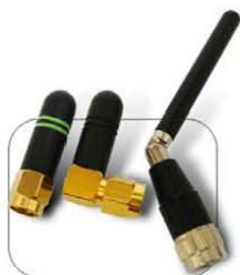
850/900/1800/1900/2100MHz and 2.4-5.8GHz antennas