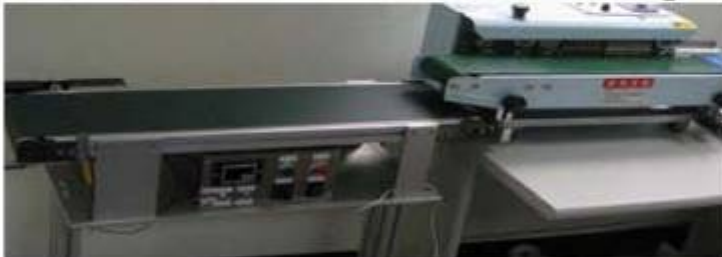
Number Of Material Machine And Automatic Sealing Machine