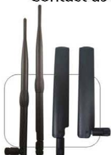
3G/4G/LTE antennas available in 700-790/824-960/1710-2170/2400-2500/2600-2690MHz