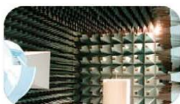
Antenna testing chamber