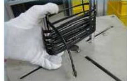
Adjustable Spooling Machine