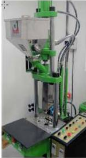
J2-S Vertical Injection Molding Machine Clamping Force 12Ton