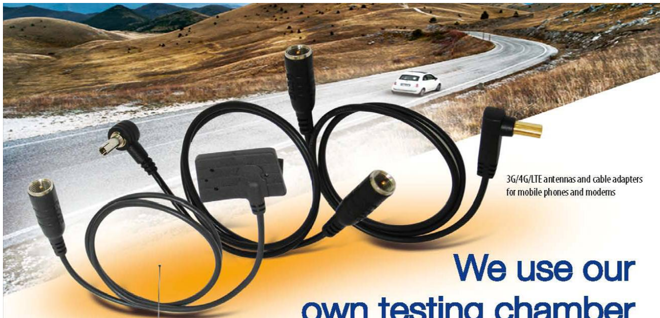
3G/4G/LTE antennas and cable adapters for mobile phones and modems